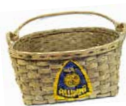
Texas FFA Alumni Chapter Basket Contest Tuesday, July 10th

For more information on the Texas FFA Alumni and the Texas FFA Alumni Basket Contest, visit the Texas FFA Alumni page on Facebook or visit www.texasffaalumni.org .